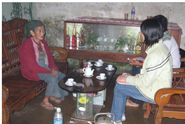
Students were able to test their interview survey skills in communities surrounding the national park.