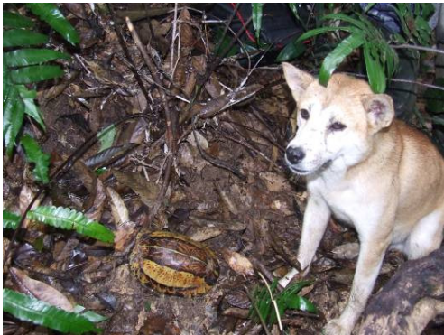
A hunting dog with a Cuora galbinifrons caught in Pu Huong Nature Reserve during field surveys